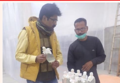
Untiring work is being continued

The minutes of RWM 2771, circulated via email and WhatsApp, were confirmed by 13 attending members in the presence of 3 guests. Sunshine contributions were collected through billing. The Chairman concluded the meeting with a wish to see everyone at the next RWM on Friday, February 7th.